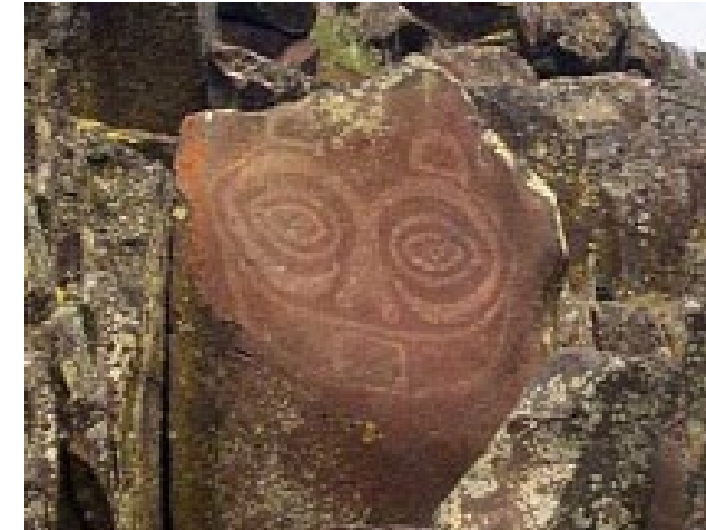
"Tsag-e-gal-el, "She Who Watches" Columbia River Gorge